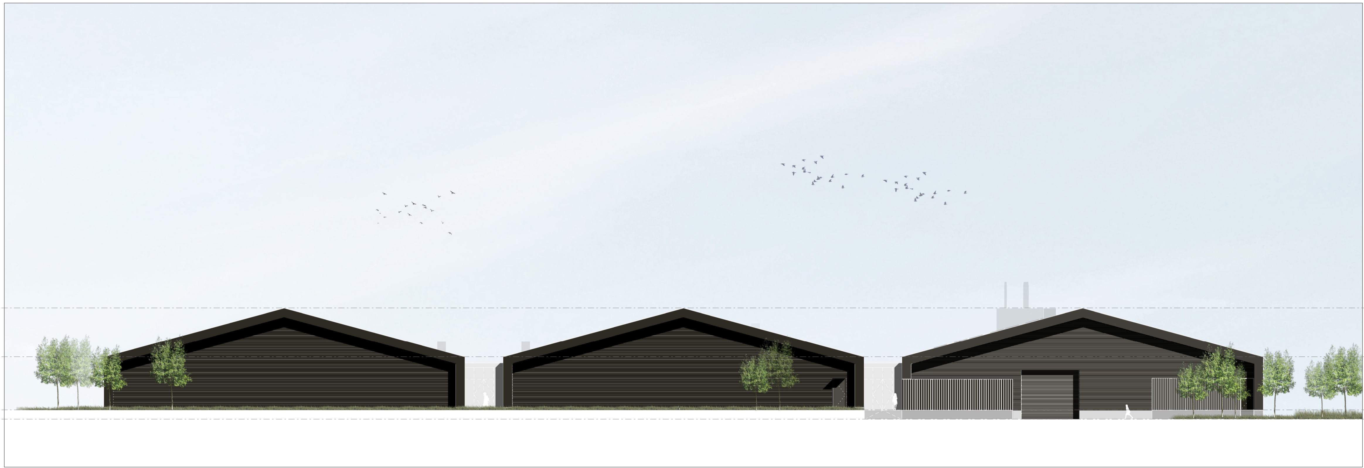
XX Elevation South Elevation - Phase 1